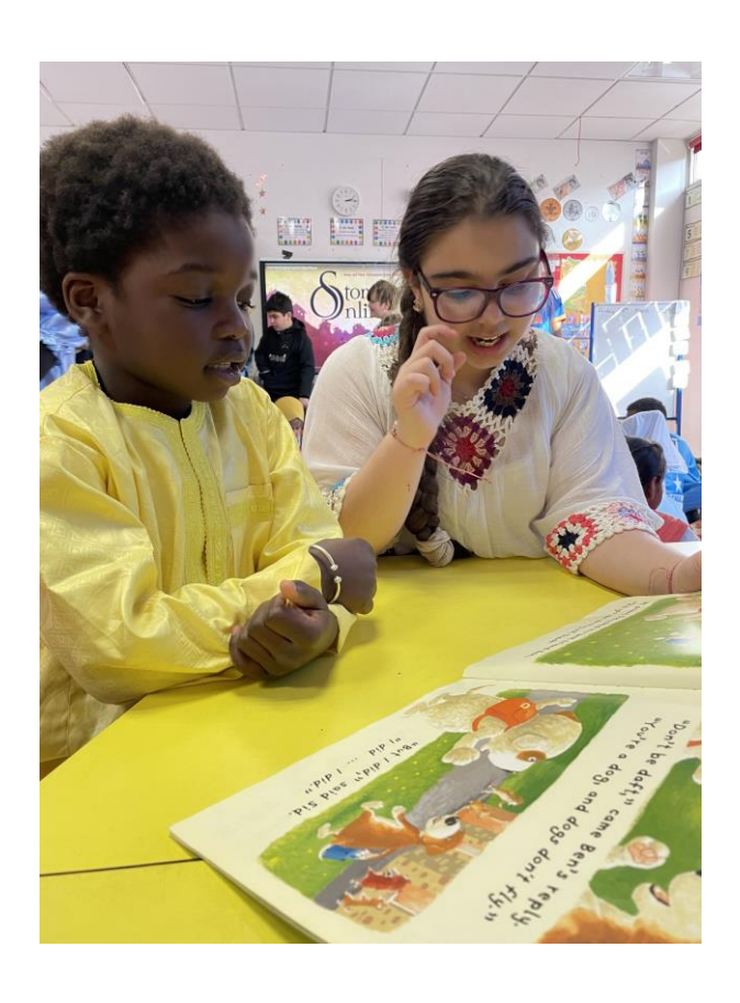
Year 2's Visit to Willesden Library