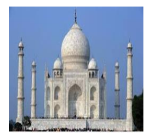
The Taj Mahal- India

Brentfield Primary School Children of Today Champions for Tomorrow