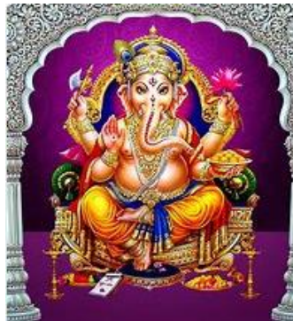
Ganesh- God of Wisdom