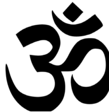
Aum symbol chanted by Hindus