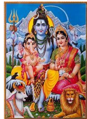
Lord Shiva, Parvati and Ganesha