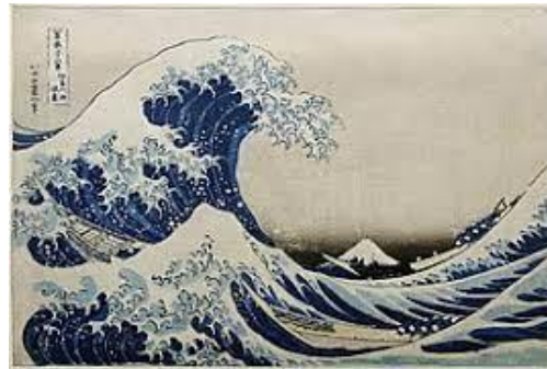
Artist-Katsushika Hokusai Year- 1831 Type- Woodblock print