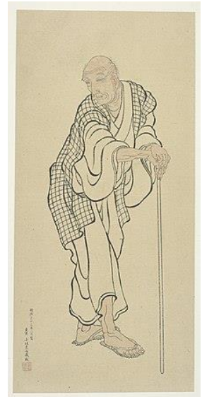
Self-portrait at the age of eighty-three

Since the age of six I have had the habit of sketching forms of objects. Although from about fifty I have often published my pictorial works, before the seventieth year none is worthy.