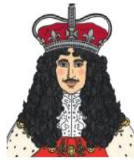
King Charles II

Samuel Pepys lived in London during the Great Fire of London and wrote about it in his diary.