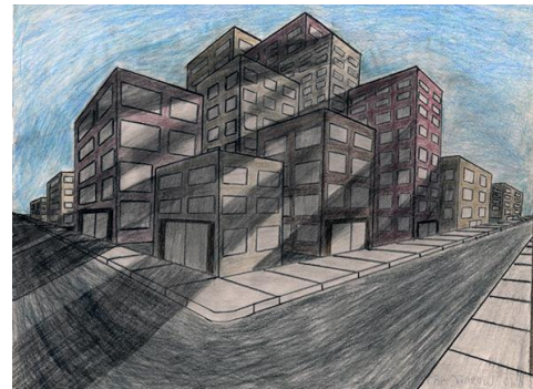
Final project idea