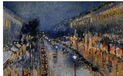
Camille Pissarro 'The Boulevard Montmartre at Night'