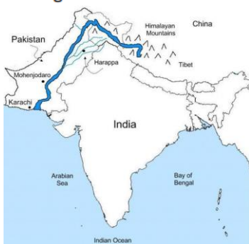
River Indus, Asia