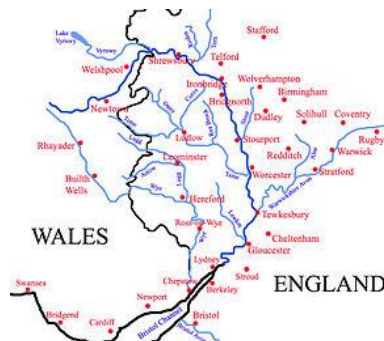
River Severn, UK

Water always flows downhill. This is important for understanding how rivers form and how they contribute to the water cycle.