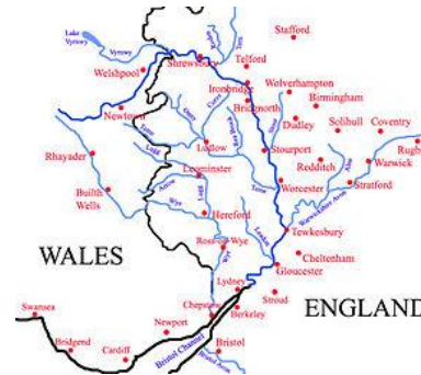
River Severn, UK

Water always flows downhill. This is important for understanding how rivers form and how they contribute to the water cycle.