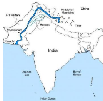
River Indus, Asia