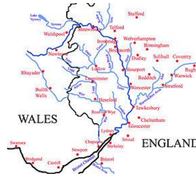
River Severn, UK

Water always flows downhill. This is important for understanding how rivers form and how they contribute to the water cycle.