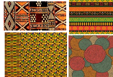
African patterns and colours