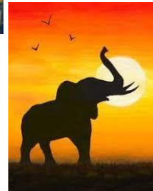
African animal silhouette