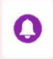
This picture shows you if you have any notifications