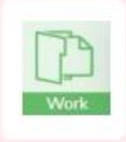
The area of Purple Mash where your work is stored