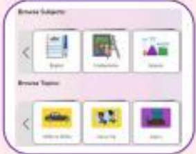
Subjects & Topics