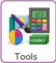
Tools section of Purple Mash