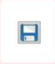
Save your work