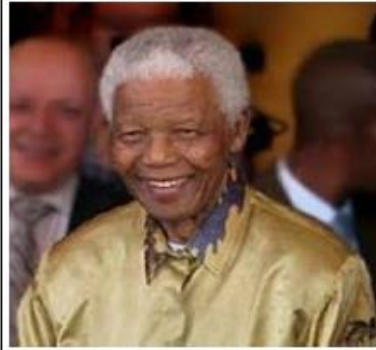
A photograph of Nelson Mandela from 2008.

He won the Nobel Peace Prize , and was given many awards for his bravery and courage.