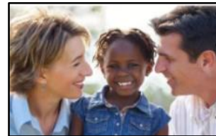
Adoptive / foster family