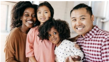
blended family / step-family