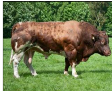
Male and female animals have some body parts that are different.

P RIVATES ARE PRIVATE A LWAYS REMEMBER YOUR BODY BELONGS TO YOU N O MEANS NO T ALK ABOUT SECRETS THAT UPSET YOU S PEAK UP, SOMEONE CAN HELP