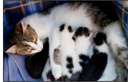
New-born animals feed from the teats on the female